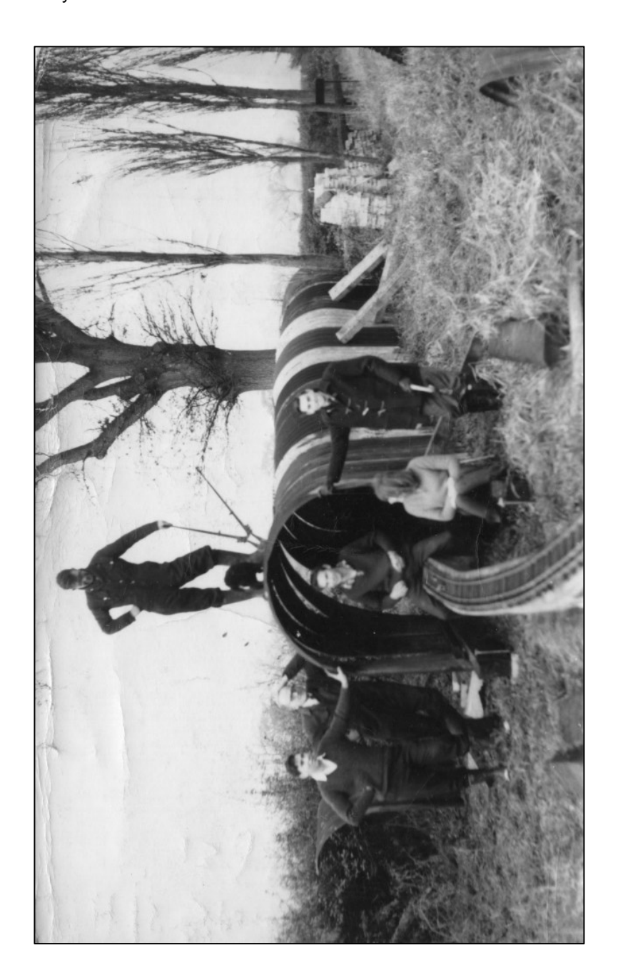
Building the new tunnel in November 1966.