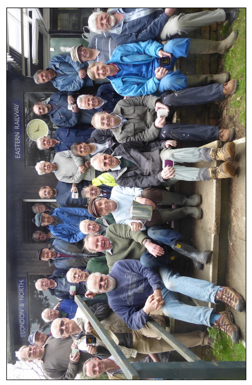
Colney Heath Team Photo. March 2018.