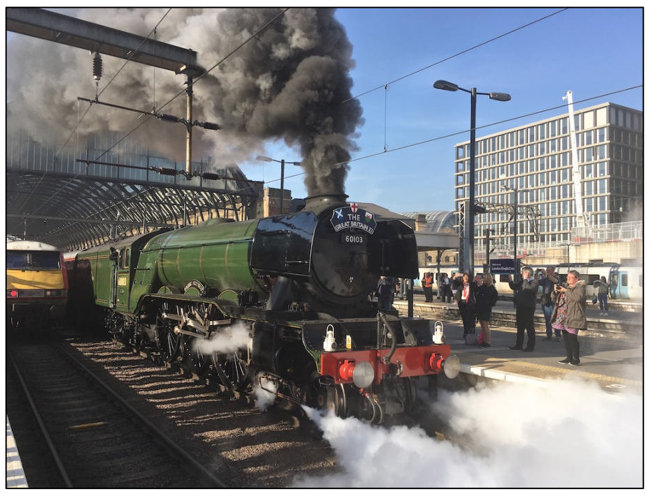
Flying Scotsman leaving Kings Cross. 19th April 2018.